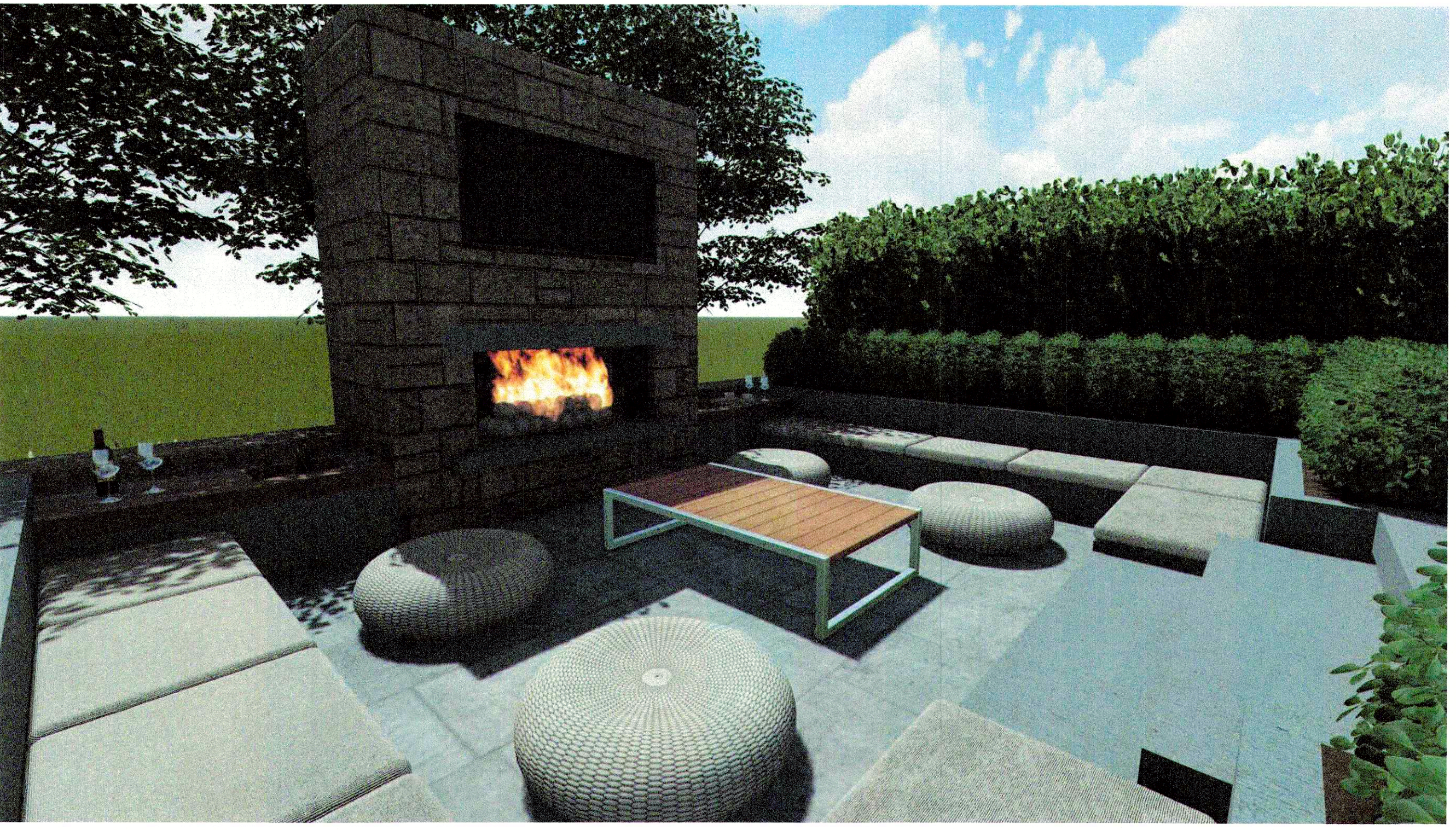
3 FIREPLACE PERSPECTIVE SCALE: UNAVAILABLE