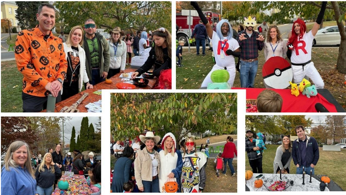
The annual Town Halloween Parade, sponsored by the PAL, the Westport Downtown Association, and the Parks & Recreation Department was held on October 29. A