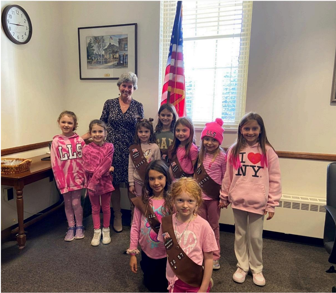
The First Selectwoman welcomed Girl Scout Troop 50757 to Town Hall on October 18. The Girl Scouts had an opportunity to tour some of the offices and ask questions about Town government.