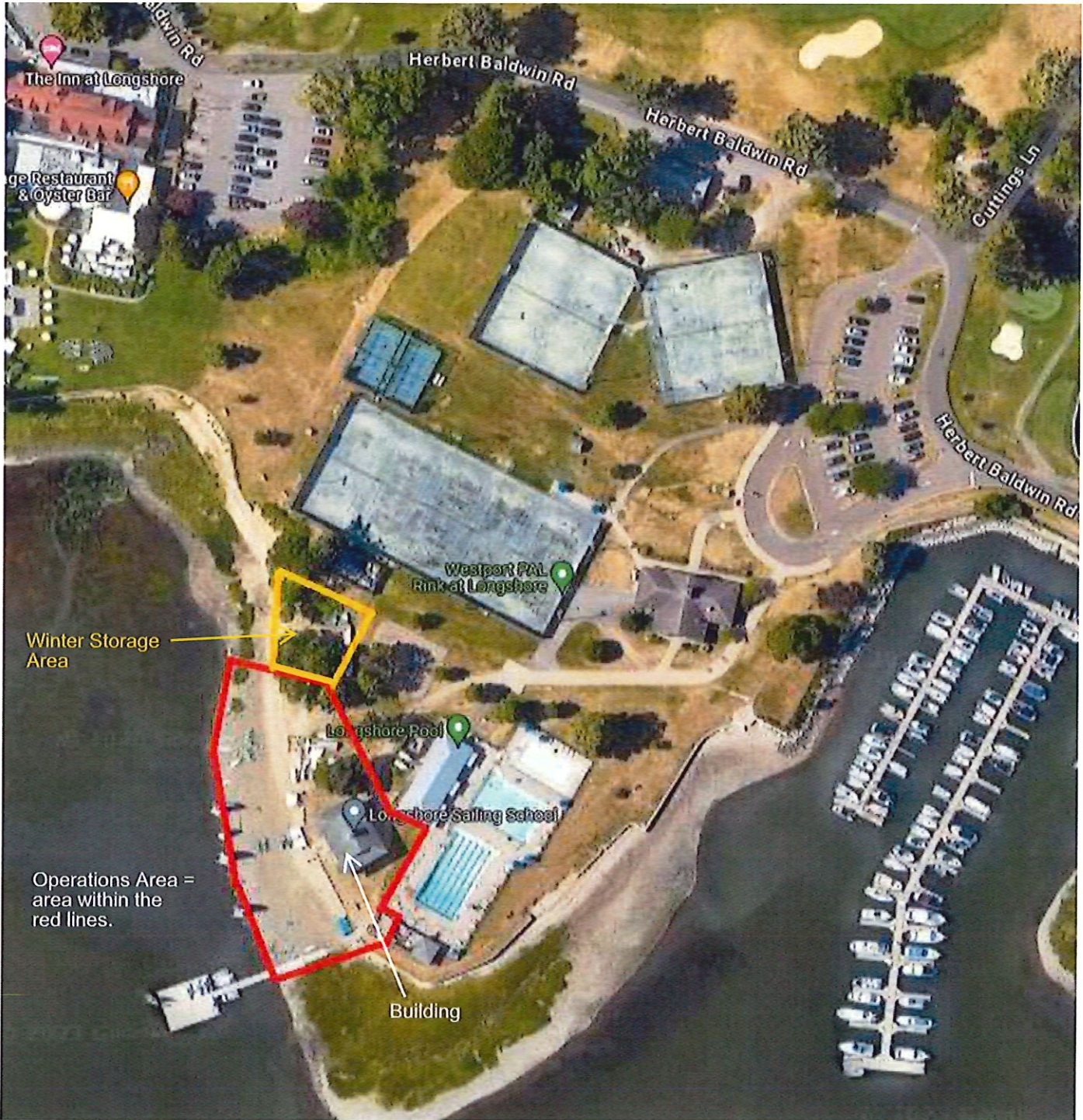
EXHIBIT B – DETAILED IMAGE

RECEIVED OCT 29 2024 WESTPORT P. & Z. C.