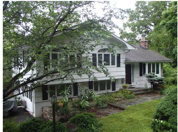
( https://images.vgsi.com/photos2/WestportCTPhotos/\00\02\84\47.jpg )