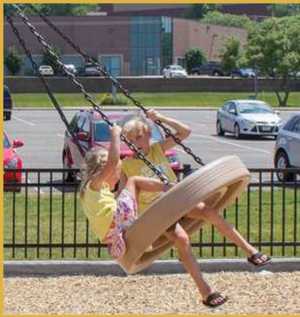
Tire Swing Seats

Colors can be changed for a more natural aesthetic