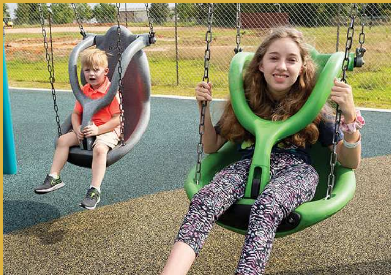
Accessible Swing Seats