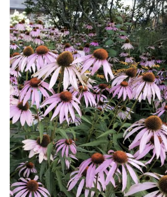
ECHINEACEA PURPUREA 'MAGNUS'