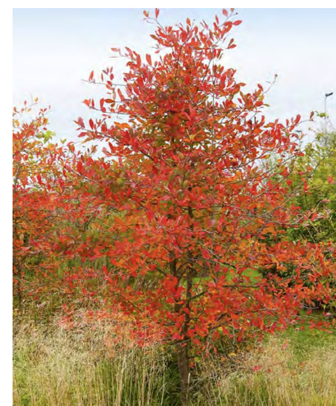
AMELANCHIER 'AUTUMN BRILLIANCE'