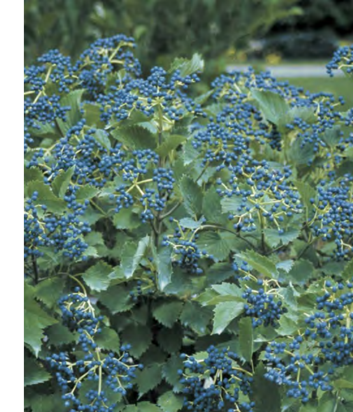
VIBURNUM DENTATUM 'BLUE MUFFIN'