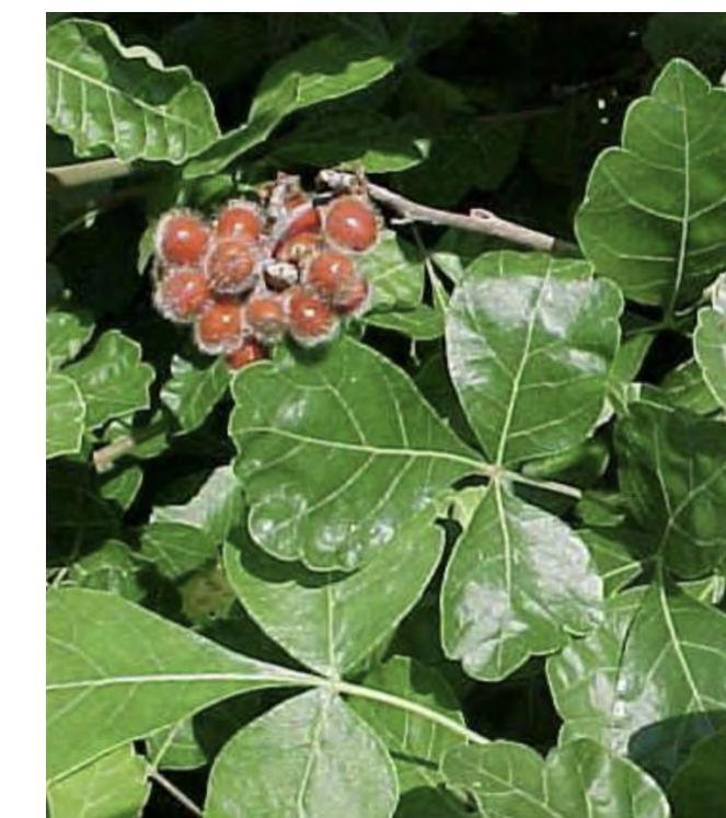
RHUS AROMATICA 'GRO-LOW'