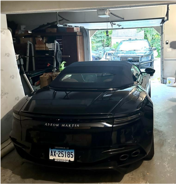
Recovered Aston Martin