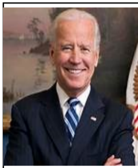
Joe Biden Democratic Party