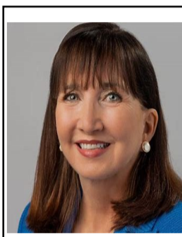
Jo Jorgensen Libertarian Party