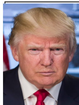
Donald Trump Republican Party