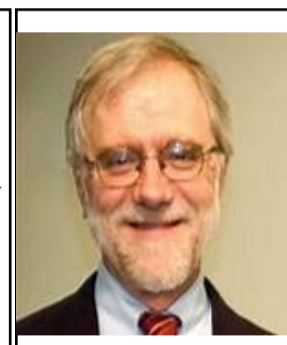
Howie Hawkins Green Party