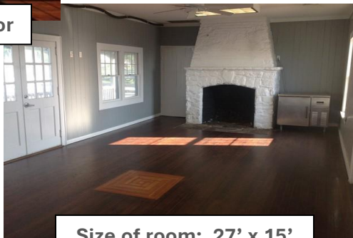
Size of room: 27' x 15'