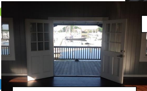
View looking out back door