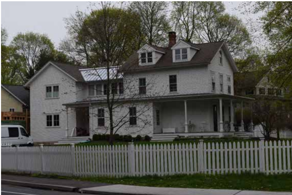
Photo 18. David Bulkley House, 15 Bridge Street, looking northeast.