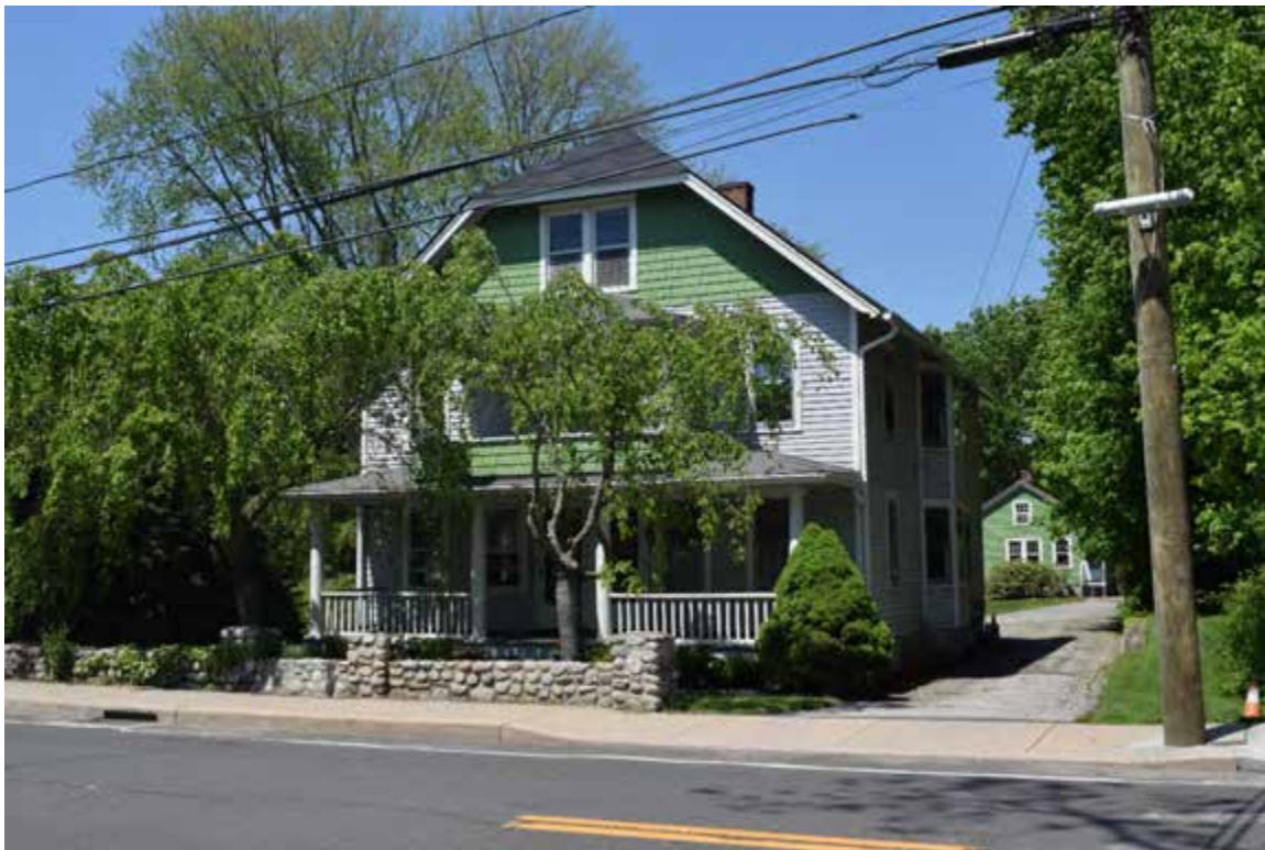
Photo 8. Henry Guyaz Duplex and Bridge Street System of Stone Walls, 29–31 Bridge Street (left) and Henry Guyaz House, 33 Bridge Street (right), looking north.