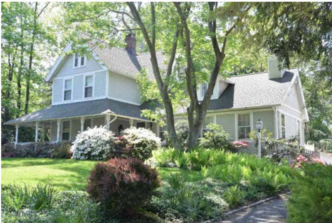
Photo 22. Edward A. Gauchet House, 188 Imperial Avenue, looking southwest.