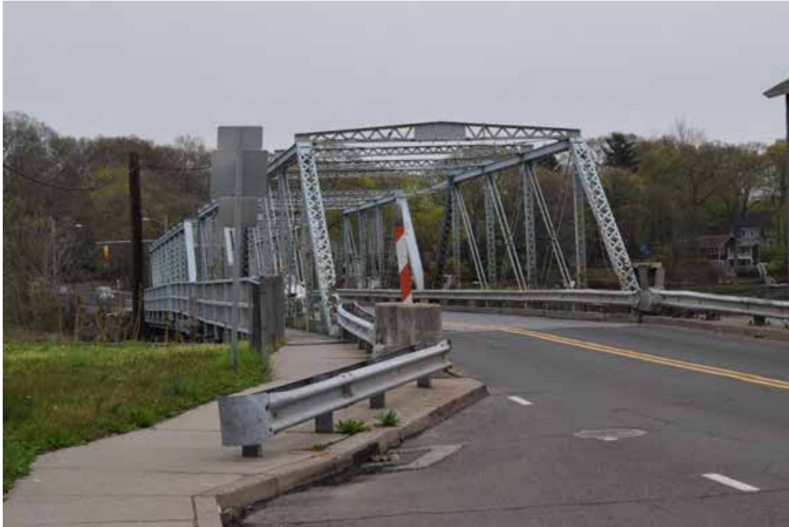
Photo 27. Saugatuck River Swing Bridge, looking east.