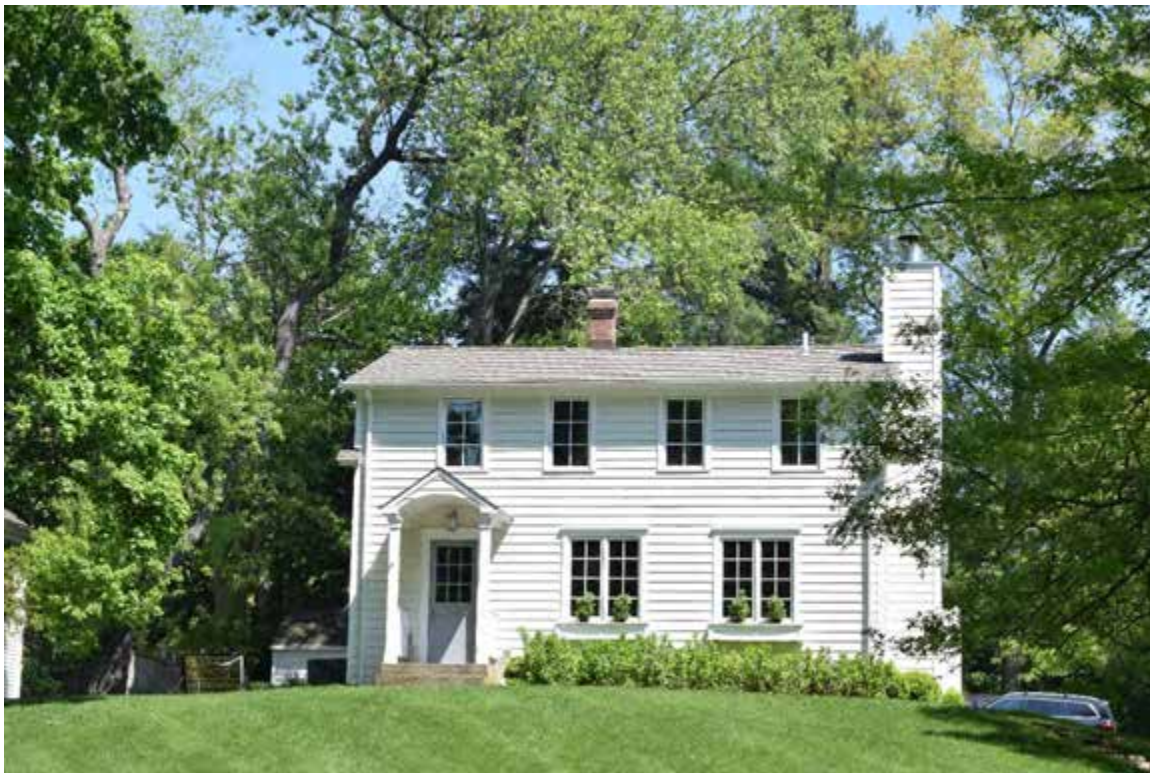
Photo 26. Francis Godfrey House, 169 Imperial Avenue, looking east.