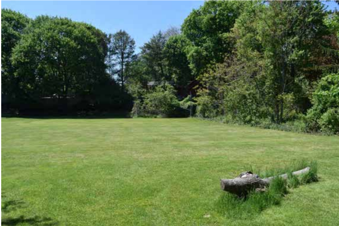
Photo 5. Saugatuck Elementary School athletic fields, 35 Bridge Street, looking northwest.