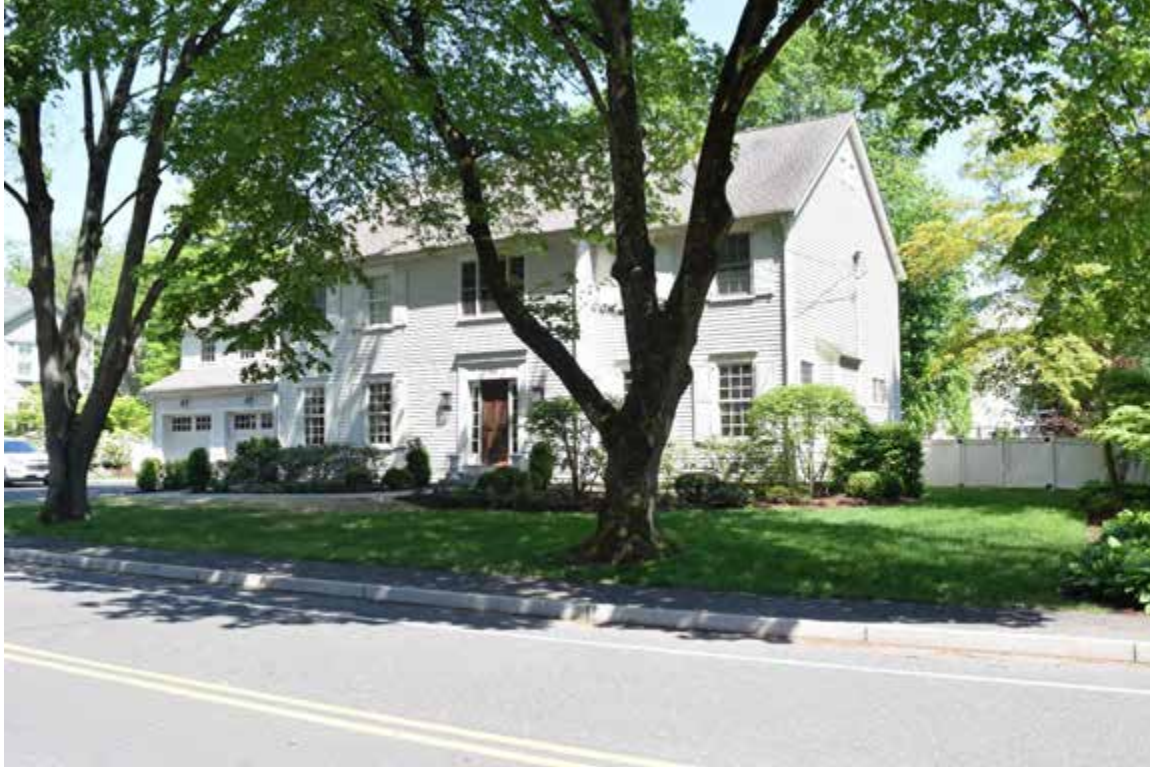
Photo 23. Francis Godfrey Duplex, 185 Imperial Avenue, looking northeast.