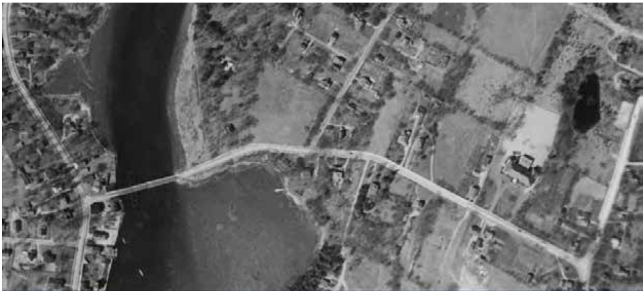
Figure 4. Aerial photograph of Bridge Street Historic District in 1934.