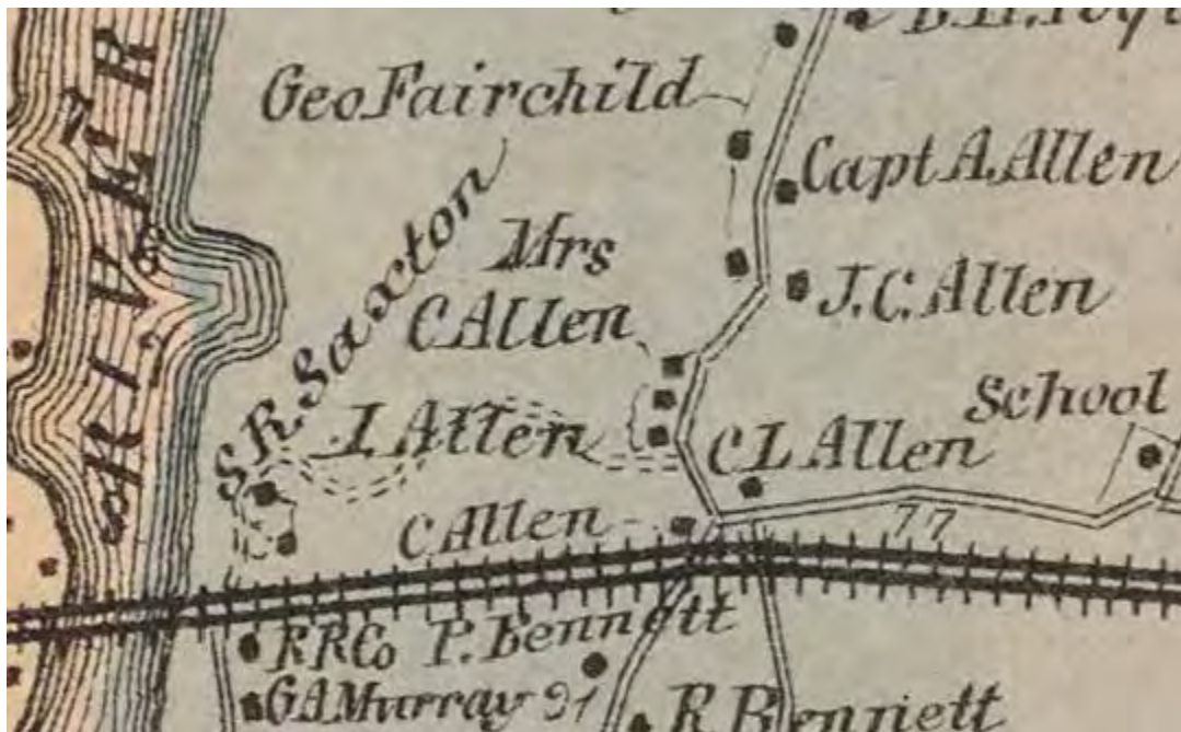
Figure 2. Map of Bridge Street neighborhood in 1867 (Beers 1867).