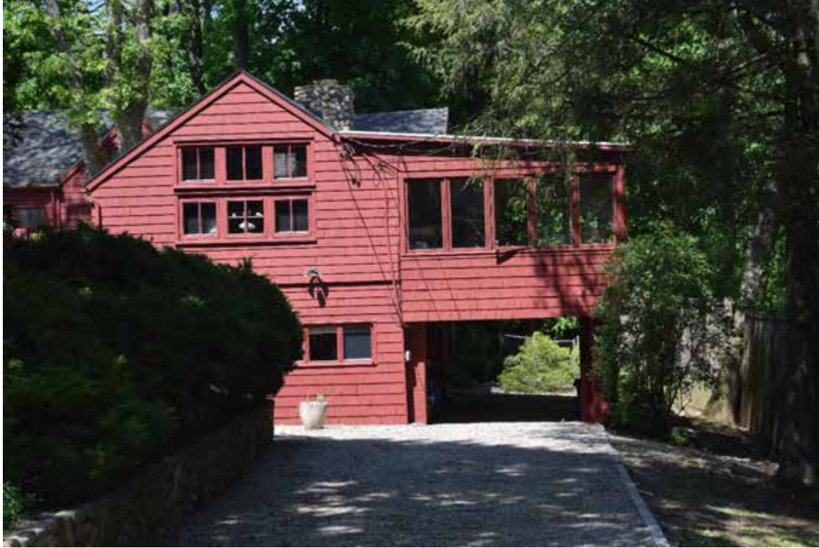
Photo 13. Nathaniel Gault Carriage House, 23 Bridge Street, looking northeast.