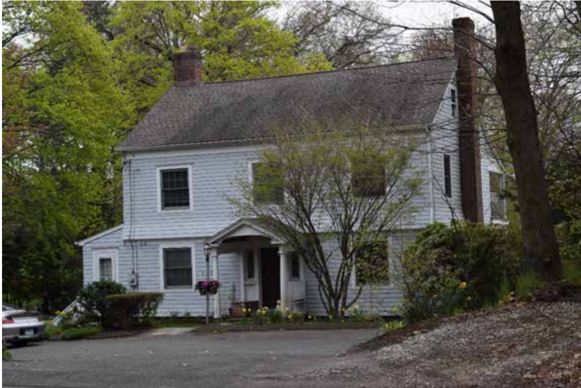
Photo 19. Albert U. Smith House, 14 Bridge Street, looking southeast.