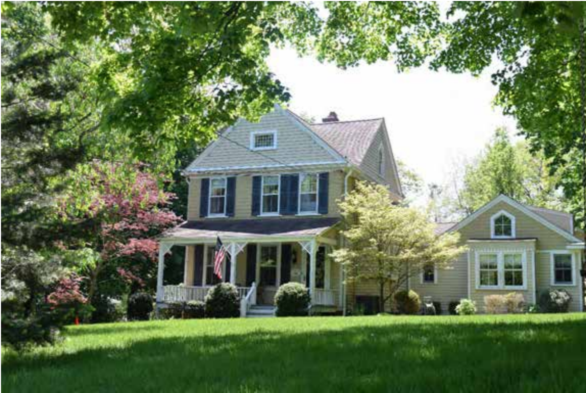
Photo 11. Orlando Allen House, 24 Bridge Street, looking southeast.