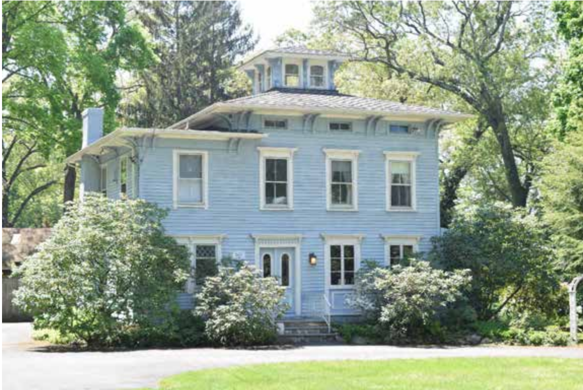
Photo 17. Frederick Hotchkiss House, 16 Bridge Street, looking south.