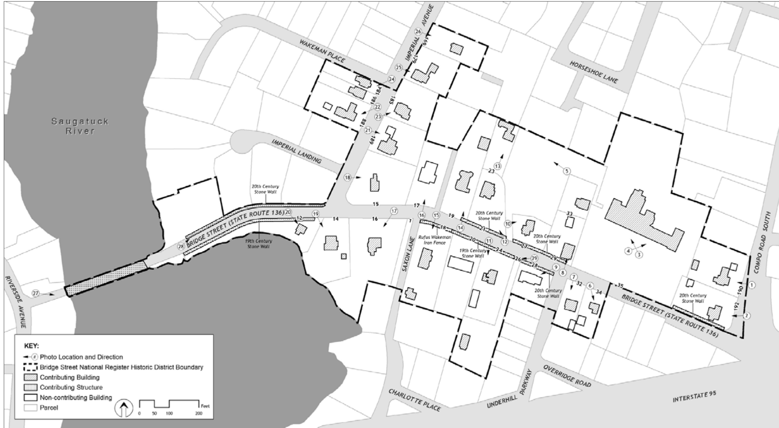
Bridge Street Historic District Map and Photo Key