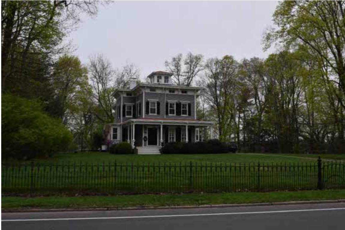
Photo 15. Rufus Wakeman House and Iron Fence, 18 Bridge Street, looking southwest.