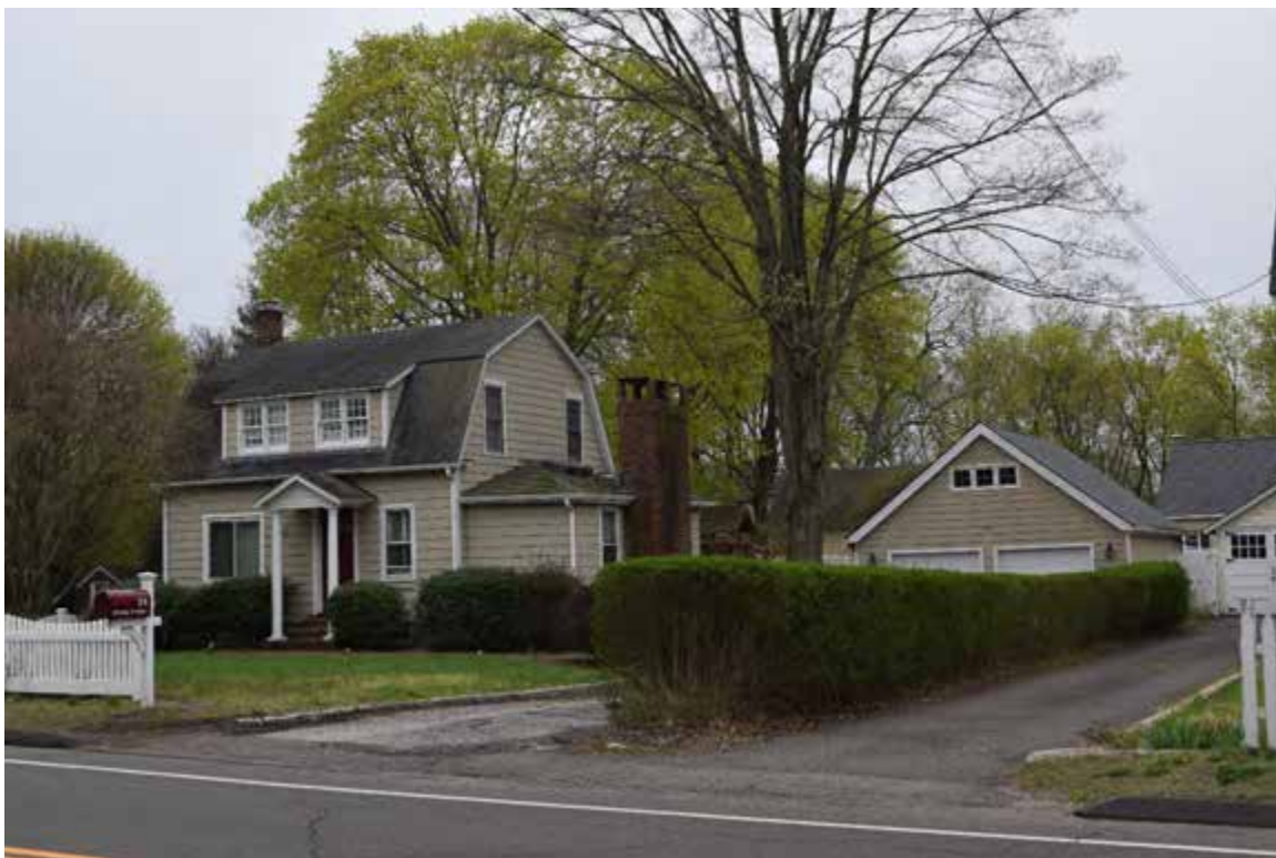
Photo 6. George Disbrow House, 34 Bridge Street, looking southeast.