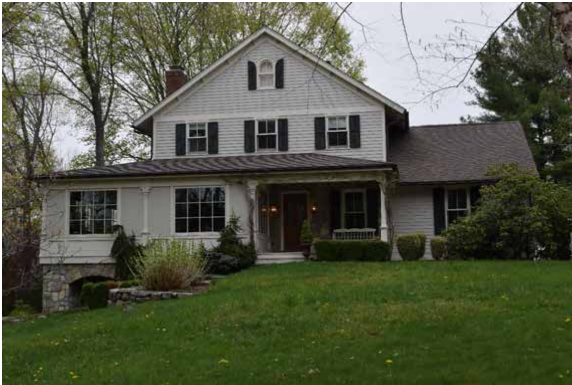
Photo 16. 17 Bridge Street, looking north.