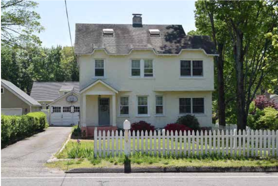
Photo 7. Joseph Postorino House, 32 Bridge Street, looking south.