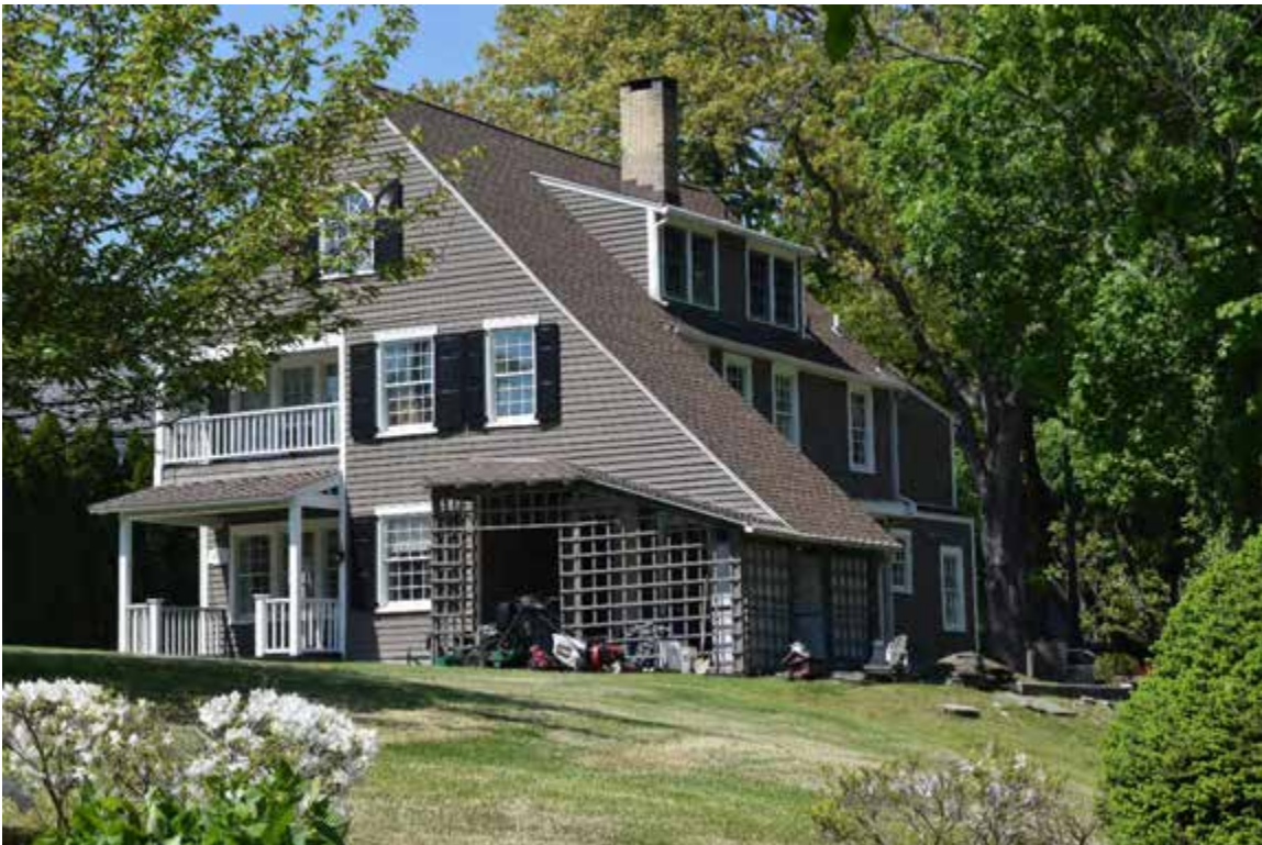
Photo 12. Daniel Kirk House, 21 Bridge Street, looking northwest.