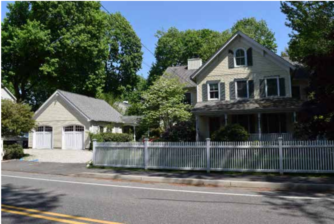
Photo 21. Francis Godfrey House, 189 Imperial Avenue, looking east.