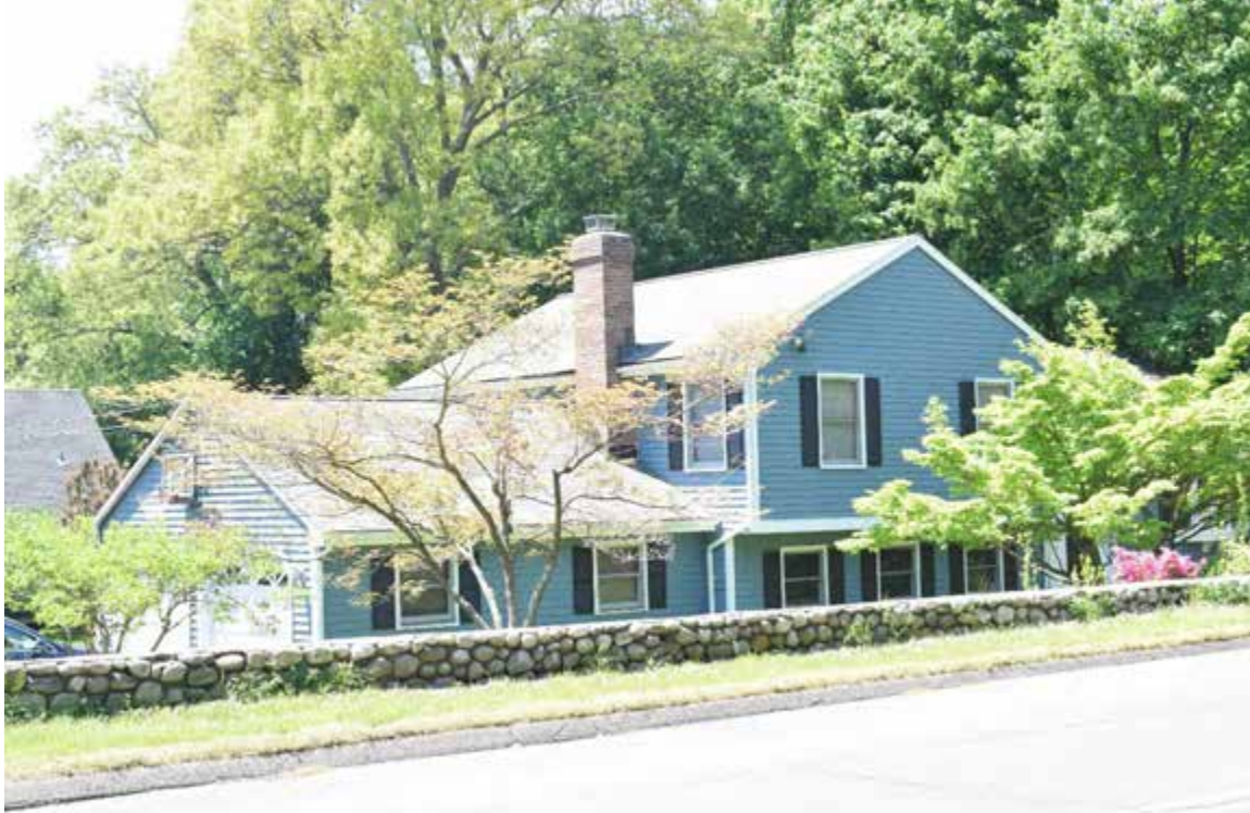
Photo 9. Anthony Arciola House and Bridge Street System of Stone Walls, 28 Bridge Street, looking southwest.