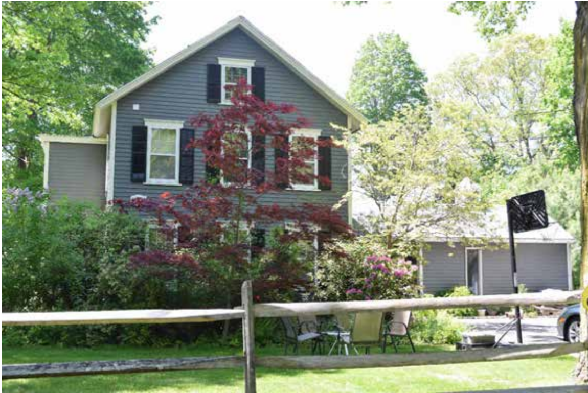
Photo 1. David and Mary Finnegan House, 190 Compo Road South, looking west.