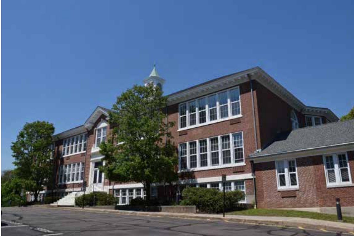
Photo 3. Saugatuck Elementary School, 1930 building, 35 Bridge Street, looking northwest.