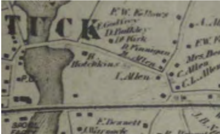
Figure 3. Map of Bridge Street neighborhood in 1879 (Hopkins 1879).