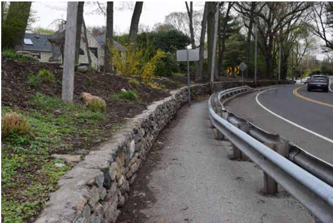
Photo 28. Bridge Street System of Stone Walls near east end of Saugatuck River Swing Bridge, looking east.