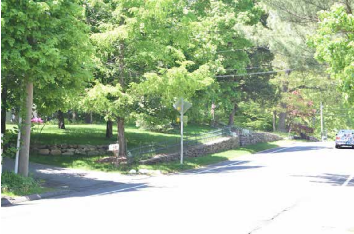
Photo 29. Bridge Street System of Stone Walls near 24 Bridge Street, looking west.