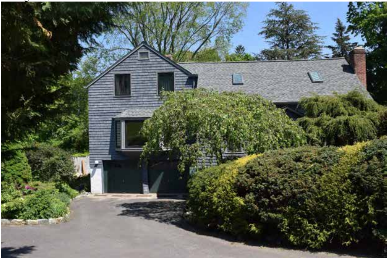
Photo 10. Lyons House, 27 Bridge Street, looking east.