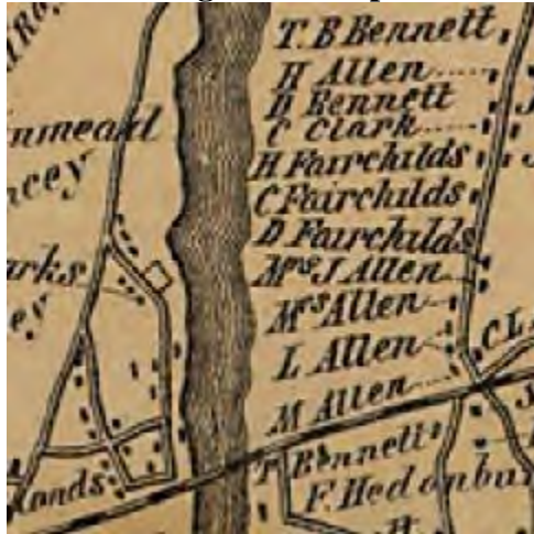
Figure 1. Map of Bridge Street neighborhood prior to the construction of Bridge Street (Clark 1856).