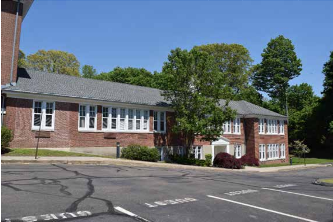
Photo 4. Saugatuck Elementary School, 1950 addition, 35 Bridge Street, looking northeast.