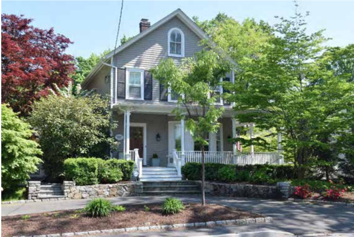
Photo 25. Charles Godfrey House, 179 Imperial Avenue, looking southeast.