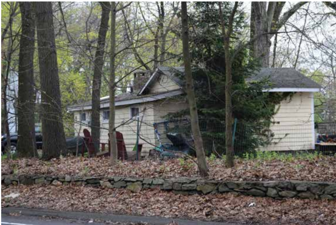
Photo 20. Anna E. Dolan House and Bridge Street System of Stone Walls, 12 Bridge Street, looking southeast.